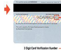
3 Digit Card Verification Number